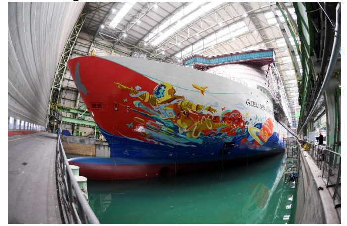
Newly completed 9,000 passenger cruise ship headed to the scrapyard

Morgen's focus is now on its sister ship, Global Dream, which is ready to float in the dock in Wismar, northern Germany, the magazine said. MV Werften's Wismar shipyard was sold to Thyssenkrupp AG's Kiel-based naval unit, which plans to build military vessels there from 2024 amid rising tensions following Russia's invasion of Ukraine. Thyssenkrupp Marine Systems wants the large dock to be available by the end of 2023, it said.