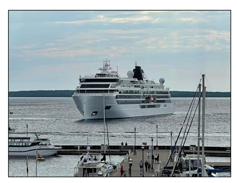
The Viking Octantis sitting on DP off Bayfield, Wisconsin late in June. The vessel will be back six more times this season.