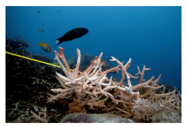
A bleaching coral is seen in the place where abandoned fishing nets covered it in a reef at the protected area of Ko Losin, Thailand June 20, 2021.

The world's oceans grew to their warmest and most acidic levels on record last year, the World Meteorological Organization (WMO) said on Wednesday, as United Nations officials warned that war in Ukraine threatened global climate commitments.