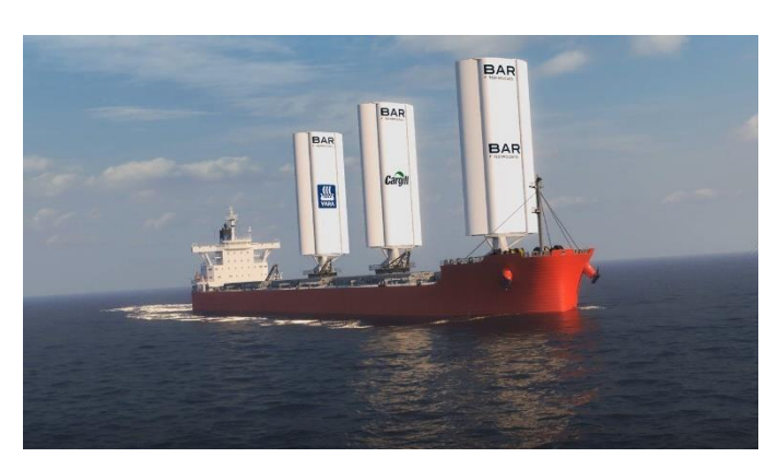
BARTech WindWings by Yara Marine Technologies

In a new take on ancient technology, Cargill, one of the world's biggest charterers of ships, is to add state-of-the art sails to a vessel early next year to test whether wind power can cut its carbon emissions, a top company executive said.