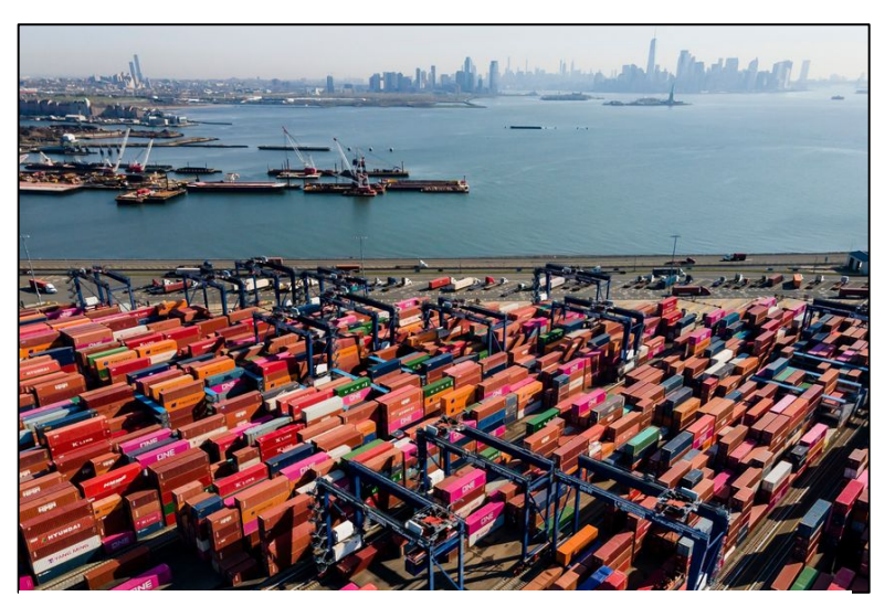
New York harbor

busiest container port complex at Los Angeles and Long Beach, where congestion has severely delayed shipments and where looming labor contract negotiations with West Coast dockworkers could threaten further disruptions.