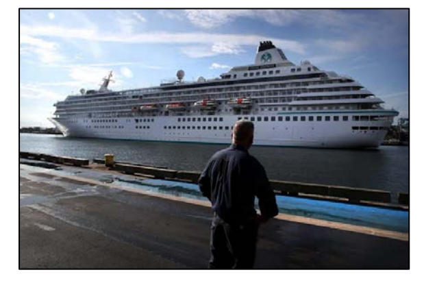
Crystal Cruise's Symphony in Boston

The two cruise ships have remained at Freeport in the Bahamas since the cruise line ceased operations in January 2022 as part of the broader financial