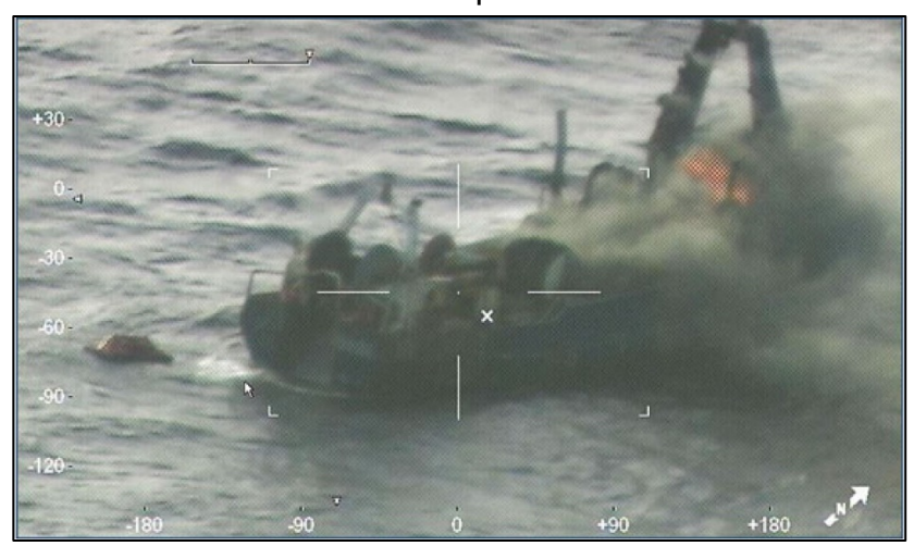
(Photo taken from the U.S. Coast Guard HC-144 aircraft showing the bow of the Nobska on fire before the rescue.)

The NTSB determined the probable cause of the fire aboard the Nobska was a failure of a