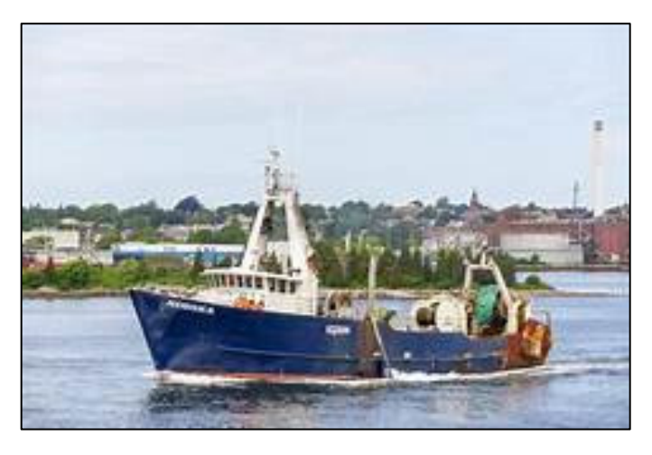
Fishing vessel Nobska

Marine Investigation Report 22/13 details the NTSB's investigation into the April 30, 2021, fire board the fishing vessel Nobska. The five-member crew was ground fishing in Georges Banks, about 80 miles east of Cape Cod, Massachusetts, when a fire started in the engine room and quickly engulfed the vessel. After unsuccessful attempts to extinguish the fire, the crew prepared to abandon ship and activated the vessel's emergency position indicating radio beacon. A U.S. Coast Guard helicopter rescued the crew from the stern of the vessel. No pollution or injuries were