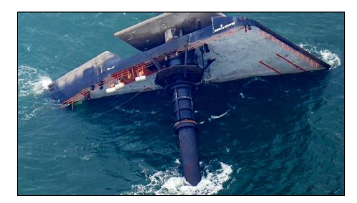
Secor Power capsized

The docket contains only factual information collected by NTSB investigators; no conclusions about how or why the Seacor Power capsized should be drawn from the information within the docket. Analysis, findings, recommendations and