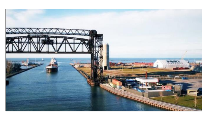
Figure 9: Port of Cleveland

Seatrade Maritime News, Barry Parker | Jan 03, 2023