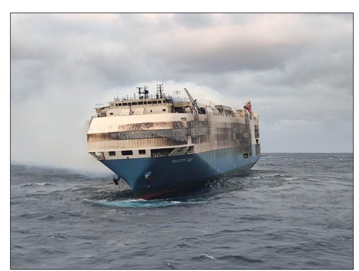
Figure 6: Fires, Inflation and Climate Change: Global Trends to Watch in Marine Insurance

"We see more high value goods being shipped by container, while the average cost of goods rises with inflation," says Khanna. "It is not unusual to see one container valued at $50mn or more for high value cargos like pharmaceuticals. These high value cargos need additional risk mitigation measures, such as GPS trackers and sensors that provide real time monitoring on temperature, moisture shock, and light and door openings, for example. At the same time cargo interests need to keep a close eye on insured values. Clients may need to adjust their insurance and policy limits, or risk being underinsured – we have already seen claims for high value container cargos where the cargo interest was underinsured by as much as $20mn." Damaged goods, including cargo, is the most frequent cause of claims, with temperature variation, theft of cargo, and inadequate shipping containers flagged as areas of concern, according to AGCS.