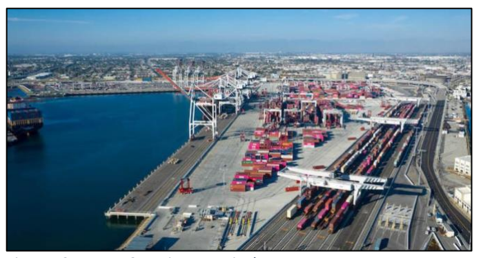
Figure 10: TraPac Container Terminal

Seatrade Maritime News, Michele Labrut | Jan 03, 2023