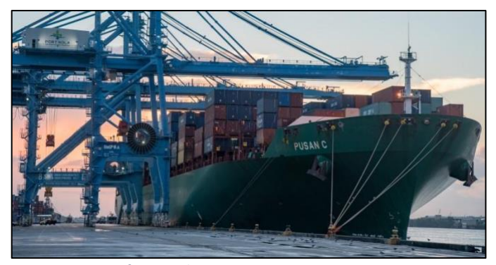
Figure 11: Port of New Orleans

The project is currently under review by the US Army Corps of Engineers. Construction for the new terminal with a capacity of 2m teu, is slated to begin in 2025 with the first berth to open in 2028.