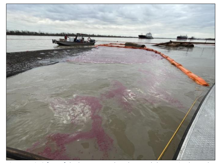
Figure 5: 940 feet of the boom was placed around the capsized vessel W.B. Wood to contain its fuel discharge on the Mississippi River near Meraux, Louisiana on Jan. 16, 2023.

The cause of the incident is under investigation.