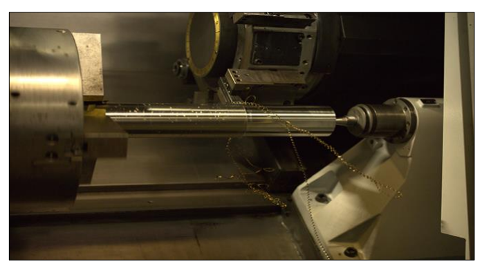
Figure 7: Courtesy of MarineLog

Salem, Mass., based driveline repair specialist H&H Propeller and Shaft has been awarded ABS (American Bureau of Shipping) certification for its proprietary marine tailshaft weld cladding process.