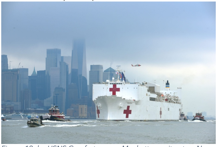
Figure 12: he USNS Comfort passes Manhattan as it enters New York Harbor during the outbreak of the coronavirus disease (COVID-19) in New York City, U.S., March 30, 2020.

Philly Shipyard, Inc. has announced the contract award to conduct a six-month feasibility study of the U.S. Navy's new T-AH(X) hospital ship.