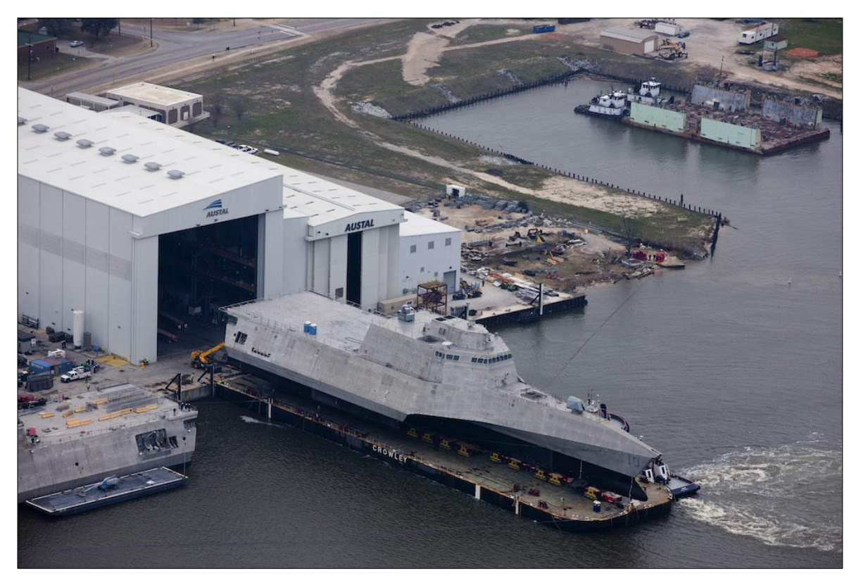
Figure 13: 150224-N-EW716-002 MOBILE, Ala. (Feb. 24, 2015) An aerial view of the future littoral combat ship USS Gabrielle Giffords (LCS 10) during its launch sequence at the Austal USA shipyard. The launch of the Gabrielle Giffords marks an important production milestone for the littoral combat ship program.