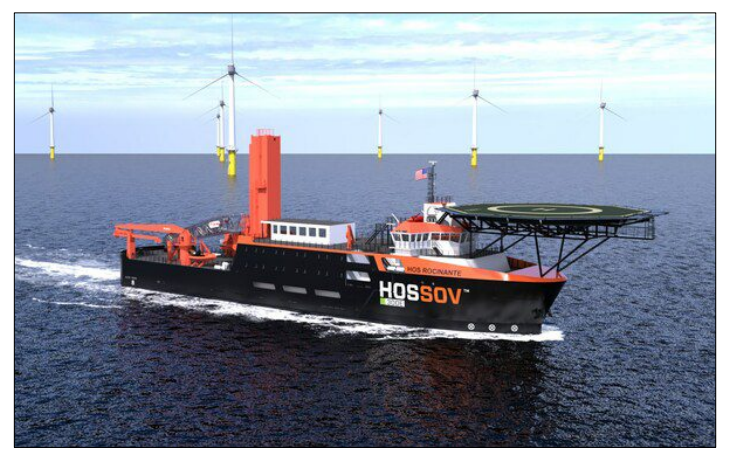
Figure 4: Hornbeck Offshore to convert one high-spec OSV to an SOV / flotel for the offshore wind and petroleum markets

Once converted, the SOV, soon to become HOSSOV 300E, will be capable of both construction and O&M operations. The vessel will also be able to help with the flotel market.