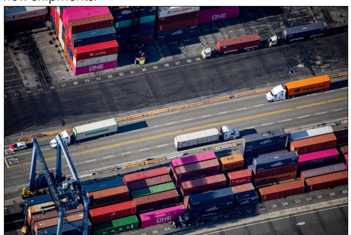
Figure 11:

He and other ocean shipping experts say <u>a</u> <u>turnaround</u> won't come until retailers and other cargo owners clear clogged U.S. warehouses to make room for new shipments.