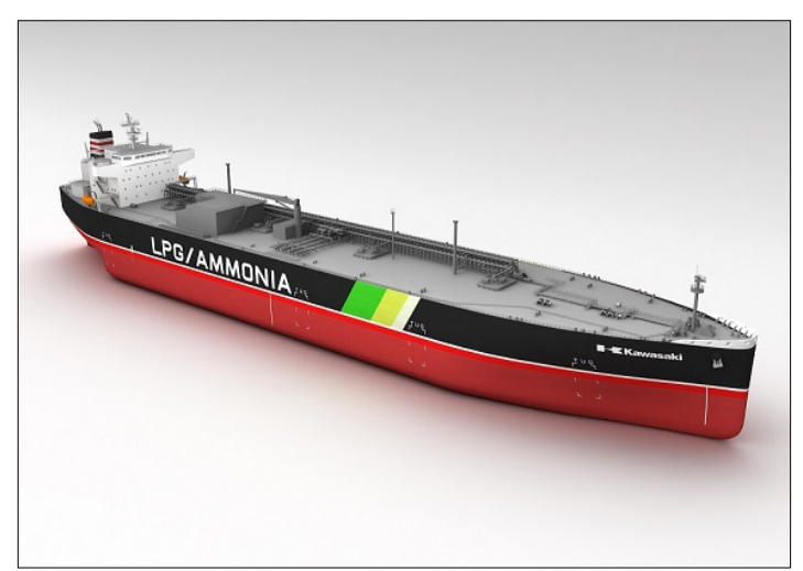
Figure 1: NYK Line's latest LPG/ammonia VLGC will be LPG dual fueled and is also expected to get an ammonia-ready notation.

This vessel is the eighth in NYK's fleet of LPG-fueled LPG carriers and the sixth in a new type of vessel capable of carrying ammonia and thus flexibly responding to various trade patterns.