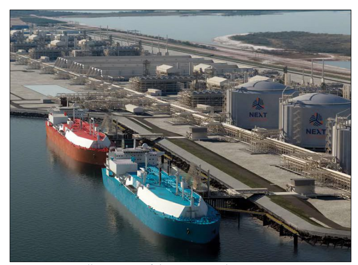
Figure 10: An illustration of the Rio Grande LNG's 984-acre facility

Houston-based NextDecade Corporation has announced an $18.4 billion final investment decision to construct the first three liquefaction trains at its Rio Grande LNG terminal, the largest proposed liquefied natural gas (LNG) export facility in the United States located at the Port of Brownsville, Texas.