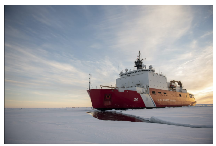
Figure 7: ARCTIC OCEAN - The U.S. Coast Guard Cutter Healy (WAGB-20) is in the ice Wednesday, Oct. 3, 2018, about 715 miles north of Barrow, Alaska, in the Arctic.

The Healy is set to conduct high-altitude research along with exercises and exchanges with foreign partners in the area.