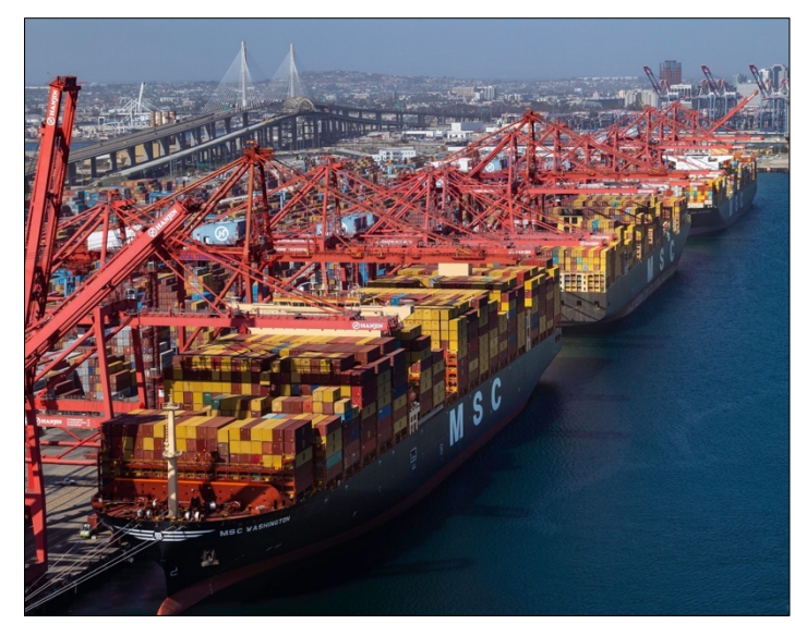
Figure 9: Photo courtesy Port of Long Beach

Economists report that consumer spending exceeded expectations during the first half of 2023 and may flatten out through the rest of the year, the Port of Long Beach said.