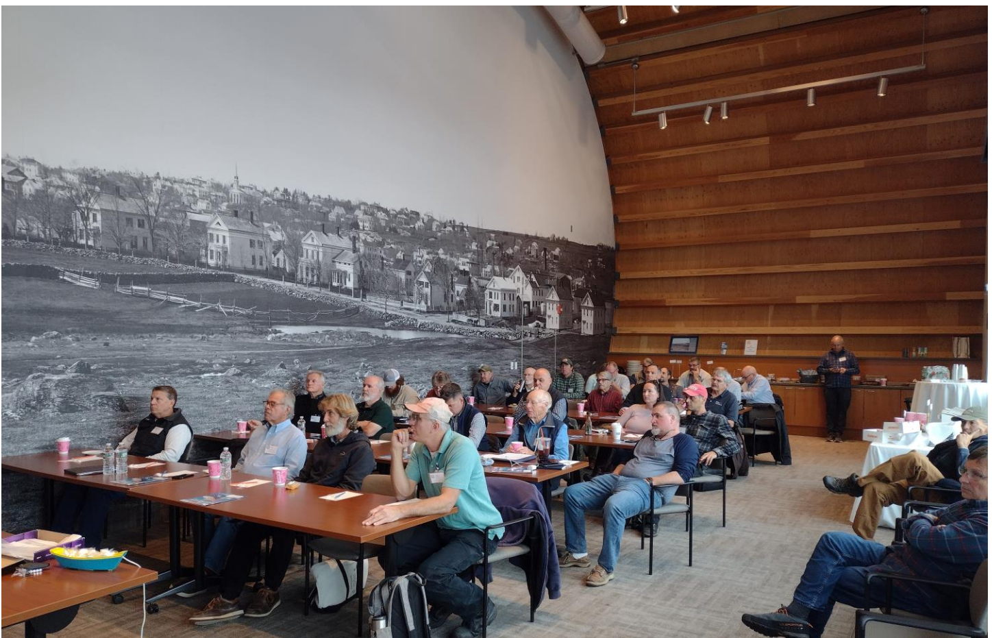
Masin Room Mystic Thompson Hall